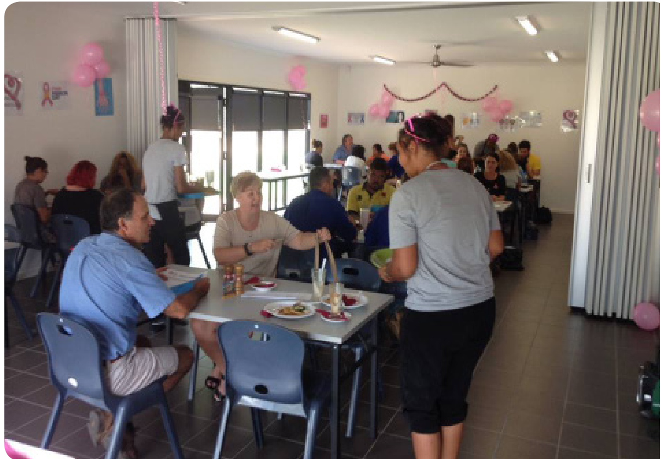
Photo: Students took ownership of the event. From designing the event menu to catering, taking orders, and welcoming guests.