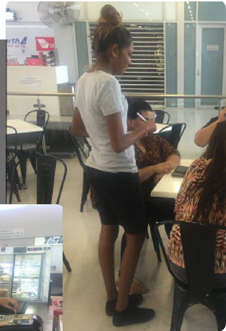
Photos: Participants acquire essential skills in customer service and cash handling at the Boab Lounge