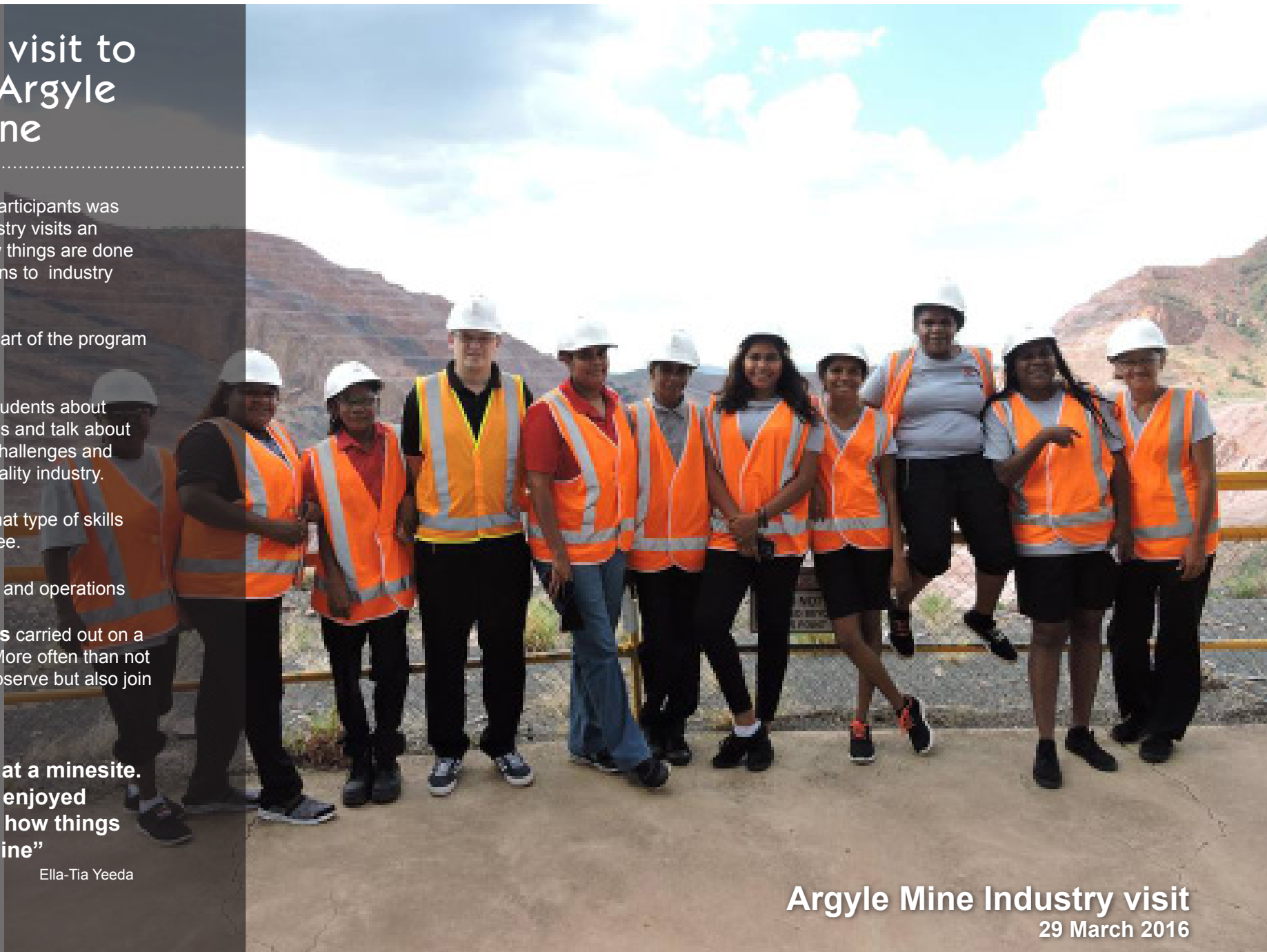
Argyle Mine Industry visit 29 March 2016