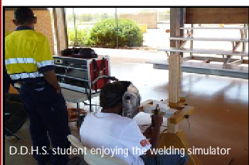
D.D.H.S. student enjoying the welding simulator