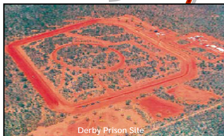
Derby Prison Site