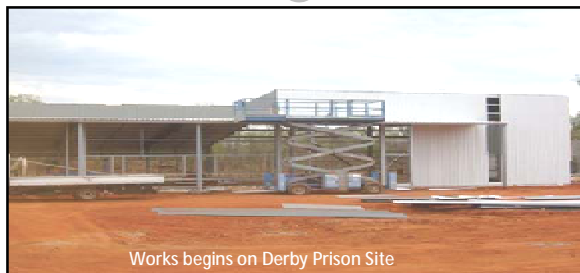
Works begins on Derby Prison Site